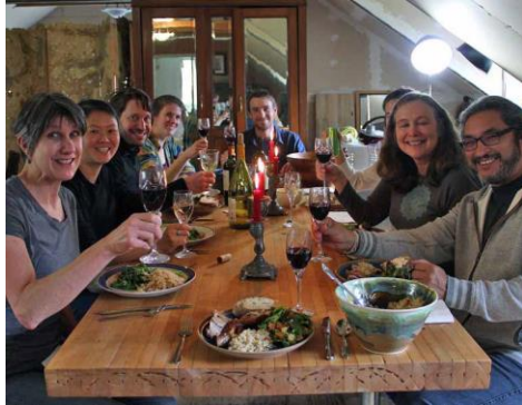
Graduation Feast 2016

Join a small group of eager learners for four days of intense, focussed, and fun holistic goat care education. Here's a sampling of what we'll cover. You'll also have the opportunity for questions and interaction with other eager goat enthusiasts!